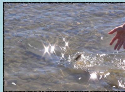
Releasing a Pink salmon on the Skeena river