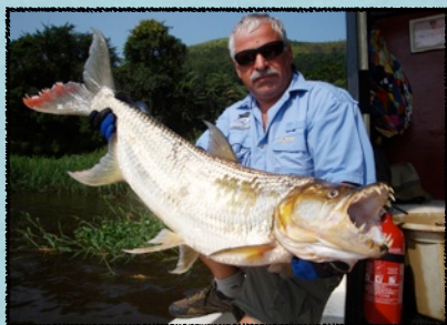
Congo river lodge - a nice trophie not our biggest but a really nice fish to be proud off.